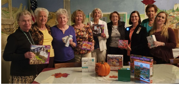
Chapter members with items they collected for veterans at McGuire Veterans Hospital