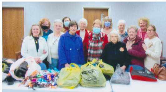
Ladies of Fincastle 797 collected items for the Veterans Care Center and Salem Veterans Hospital.